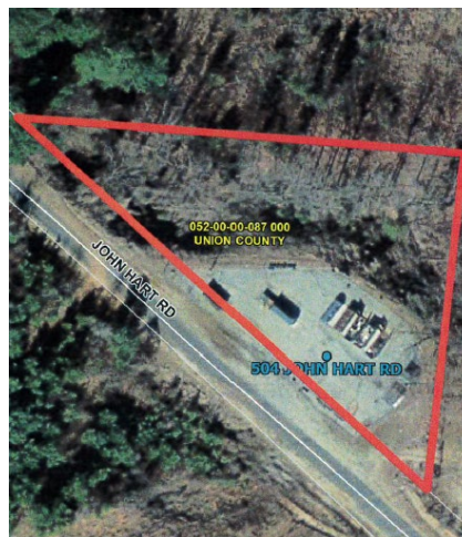
John Hart Recycle Center

Station 8 John Hart Recycle Center , Located @ 504 John Hart Rd – Peak growing season (April – October) the grass is mowed/string trimmed at least two times per month and/or possibly three times if we receive a lot of rain. The trash is picked up and the area is blown off before leaving the site. Off season (November – March) trash is collected and emptied at least once per month.