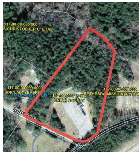
Santuc Recycle Center

Station 4 Santuc Recycle Center , Located @ 100 Suber Ln – Peak growing season (April – October) the grass is mowed/string trimmed at least two times per month and/or possibly three times if we receive a lot of rain. The trash is picked up and the area is blown off before leaving the site. Off season (November – March) trash is collected and emptied at least once per month.