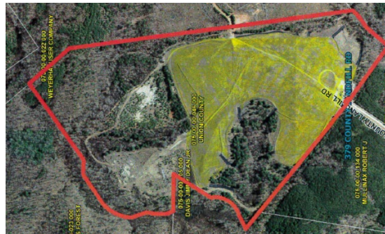
Union County Landfill

rain. The trash is picked up and the area is blown off before leaving the site. Off season (November – March) trash is collected and emptied at least once per month.