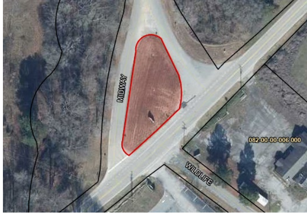
Midway Green Entrance

Mac Johnston Industrial Park Sign. , Located @ 100 Highpoint Dr., - Well manicured flower bed surrounding the park sign. Mulch needs to be changed at minimum of once per year. Flower bed is to be maintained. Bushes and plants to be changed out as needed. Please provide a projected annual landscaping and mowing schedule with costs attached in submittal.