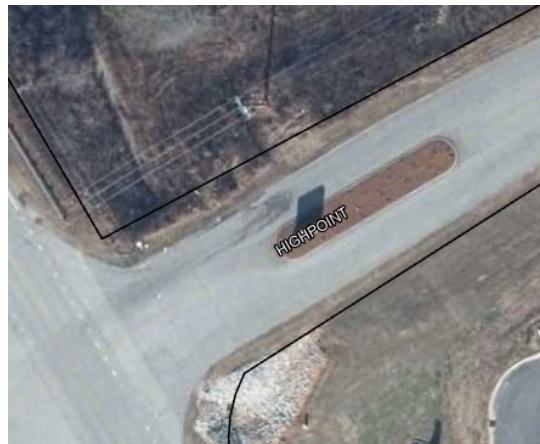
Mac Johnson Entrance- Highpoint Drive

Mac Johnston Industrial Park Sign. , Located @ 100 Highpoint Dr., - Well manicured flower bed surrounding the park sign. Mulch needs to be changed at minimum of once per year. Flower bed is to be maintained. Bushes and plants to be changed out as needed. Please provide a projected annual landscaping and mowing schedule with costs attached in submittal.