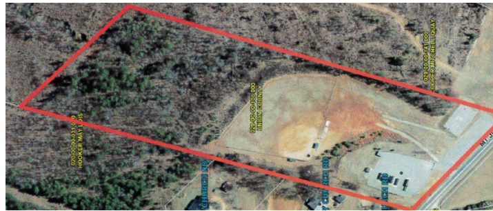
Kelton Ballfield- Mt. Joy Church Rd

Kelton Ballfield/Station 7 Kelton Recycling Center. , Located @ 194 Mt. Joy Church Rd. - Peak growing season (April – October) the grass is mowed/string trimmed at least two times per month and/or possibly three times if we receive a lot of rain. The trash is picked up and the area is blown off before leaving the site. Off season (November – March) trash is collected and emptied at least once per month. Special Events are on an On-Call Basis. The Dirt Infields will be maintained by Union County Parks and Recreation.