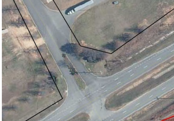
Commerce Park Entrance

rain. The trash is picked up and the area is blown off before leaving the site. In addition, mulch will need to be changed out at minimum of once per year. Entrance is to be well maintained and will need to be sprayed, fertilized, and treated throughout the year. Off season (November – March) trash is collected and emptied at least once per month. Special Events is an On-Call Basis. Please provide a projected annual landscaping and mowing schedule with costs attached in submittal.